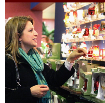
Santa Claus Christmas Store