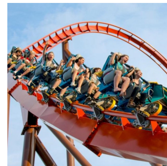
Holiday World & Splashin' Safari

Visit the Santa Claus Museum & Village to learn about the history of this picturesque town and see the 1935 Santa Claus Statue, Santa Claus Church, and original Santa Claus Post Office. Venture over to Santa's Candy Castle for a delicious frozen hot chocolate and chat with an elf on the North Pole Network. Browse through the gigantic Santa Claus Christmas Store for holiday treasures.