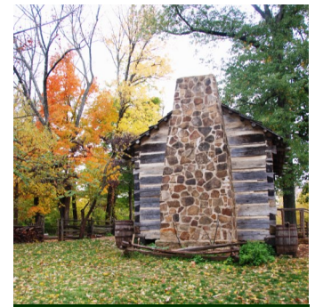
Lincoln Boyhood National Memorial

Stop by Lincoln Landing where Abe launched his first flatboat trip to New Orleans, inspiring his anti-slavery views, and see Lincoln Ferry Park where he was sued over his ferry business, sparking an interest in law.