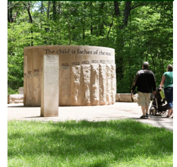
Lincoln State Park