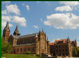
Saint Meinrad Archabbey

As one of only two archabbeyes in the U.S., the Saint Meinrad Archabbey offers tranquil grounds and beautiful architecture. A great place to get away and relax in St. Meinrad, Indiana.